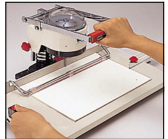
Easy Paper Alignment